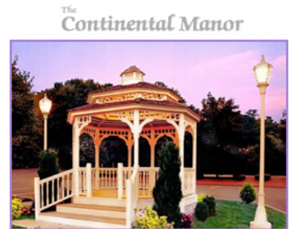
112 Main street . Norwalk, CT 06851